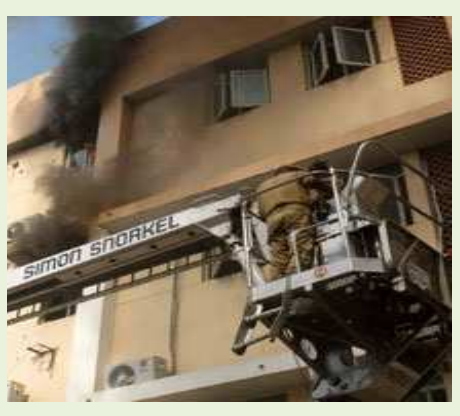
Fire incident in 'D' block of AP Secretariat

DGFS replied (November 2012) that Multi Storied Building Inspection Committee (MSBIC) <sup>26</sup> made certain recommendations for fire precautionary measures to be adopted in each block in the AP Secretariat and instructions in this regard would be issued to the concerned to ensure fire and life safety.