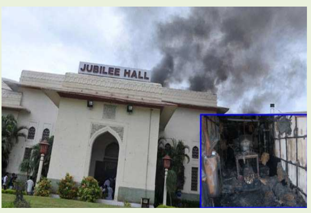
Fire incident at Jubilee Hall (Inset: burnt AC plant)

It is pertinent to mention that there was a fire accident on 1 July 2012 in the Jubilee Hall 15 minutes after conclusion of an important meeting which was attended by high dignitaries.