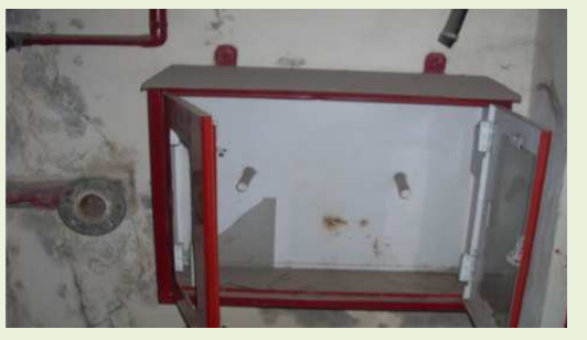
Defunct Hydrant system in Gagan Vihar (12 July 2012)

DGFS replied (November 2012) that the Gagan Vihar MSB was inspected (September 2012) by the Department and several deficiencies were noticed in fire safety measures. He further stated that the Vice-Chairman and Commissioner, AP Housing Board was requested to provide fire safety measures and to ensure compliance of required fire precautionary measures.