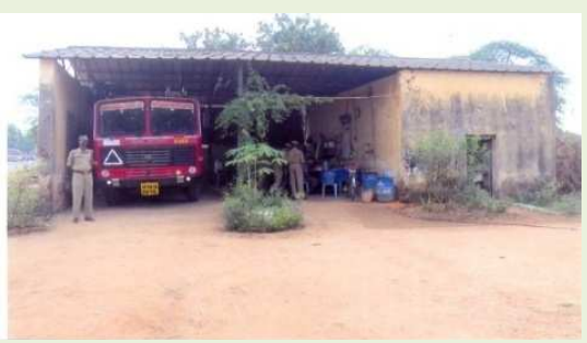
Tandur FS-Fire tenders parked in the open (17 September 2011)