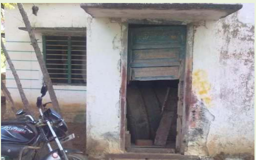
Parigi FS rest room (17 September 2011)