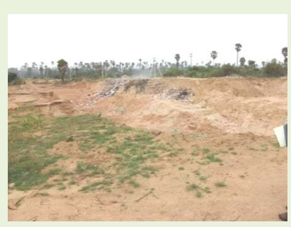
Dump yard next to Ahmedguda colony

occupancy at present was about 1700, indicated (December 2012) that the action for treatment of dumped waste was initiated.