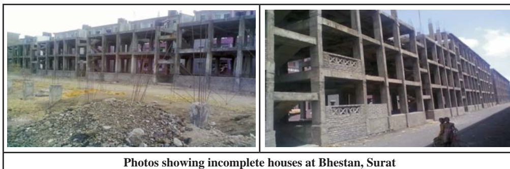
Photos showing incomplete houses at Bhestan, Surat

Audit observed that though the agency failed to complete the work within the stipulated date, only notices were served by SMC and the action of blacklisting the agency was taken after three years from the stipulated date of completion. It was also seen that in response to a tender notice on the fourth attempt, an agency 14 quoted 9.91 per cent above the estimated cost (SOR of 2011-12), but the Tender Scrutiny Committee (TSC) rejected it. All the subsequent attempts did not evoke any response (July 2012). Thus, construction of 640 DUs remained incomplete even after incurring expenditure of ₹3.97 crore.