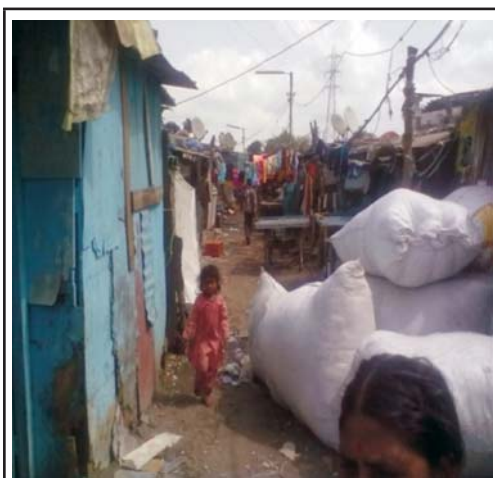
Photo showing slums at Bhimnagar

(ii) The CSMC approved (January 2009) two redevelopment housing projects for urban poor residing in slums at Bhimnagar and Kamrunagar in Surat city at an estimated cost of ₹29.48 crore (1,176 DUs) and ₹23.75 crore (740 DUs) respectively.