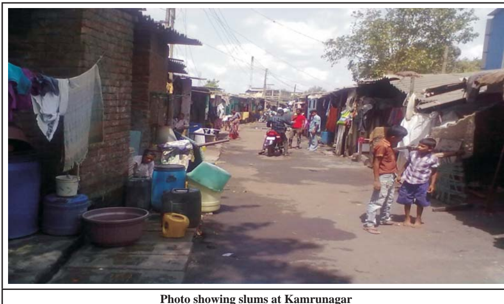
Photo showing slums at Kamrunagar

It was found that work at both the places was awarded to an agency 10 (April 2010), however, due to non-availability of clear site, the agency could not commence the work and was subsequently relieved (October 2011). Since then, no further progress was made and grant of ₹8.06 crore was lying unutilised (June 2012) with the Surat Municipal Corporation (SMC).