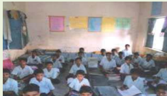
Non-provision of benches in Ashram (B) High School, Raiguda, Adilabad