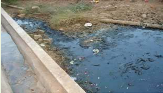
Open drainage in Integrated Hostel Welfare Complex Nandyal, Kurnool district