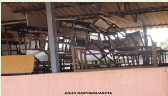
Ashram High School (Girls), Narsingapeta