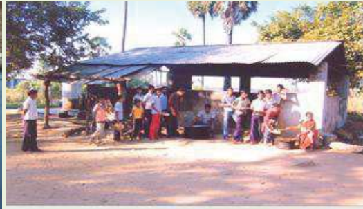
Serving food in open place - Government Ashram High School, Redyala, Warangal district