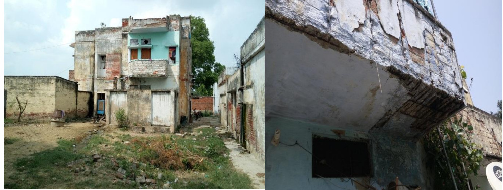
Dilapidated condition of residences at Police Station, Bithur Kanpur

In test-checked districts, the availabilities of residential houses were only 5,729 (14 per cent ) against the available manpower of 42007. Further, the position of residential houses in test-checked police stations was also similar with availability of only 22 per cent (817 against the available manpower of 3,604); housing to police personnel. Availability of housing in test-checked districts and police stations are given in ( Appendices 10.8 & 10.9 ). The condition of the houses was also not satisfactory as given in pictures below.