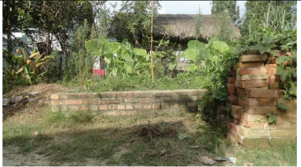
Site for building of Khangabok Part I Awang Leikai AWC, Thoubal Project, Thoubal district started under Phase-IV was abandoned.