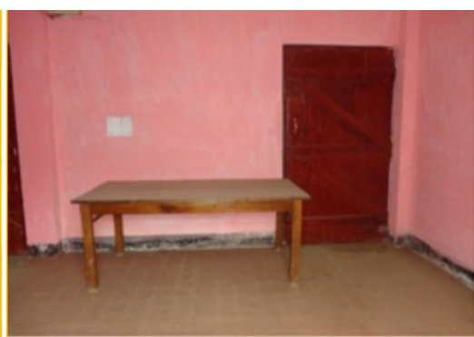
Blood bank room at District Hospital Ukhrul was used as Opioid Substance Therapy Centre (only \stackrel{?}{\sim} 6.55 lakh out of approved amount of \stackrel{?}{\sim} 12 lakh was released)

Thus, the services of AYUSH Doctor, utility of OT Room, quarters and benefit of blood bank were deprived to the populace served by these facilities.