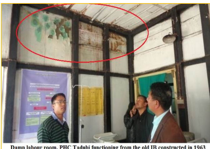
Damp labour room, PHC Tadubi functioning from the old IB constructed in 1963

a) Primary Health Sub-Centre (PHSC) : Out of 18 checked tests PHSCs in the two