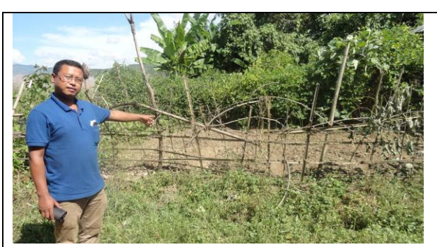
Site for Building of Island AWC, Machi Project in Chandel district which was listed as constructed in Phase-II.

It was also noticed that expenditure of ₹ 5.52 crore was already incurred in respect of the 336 AWC buildings which were yet to be constructed. Sample photographs of the identified sites for constructions of these AWCs are shown below.