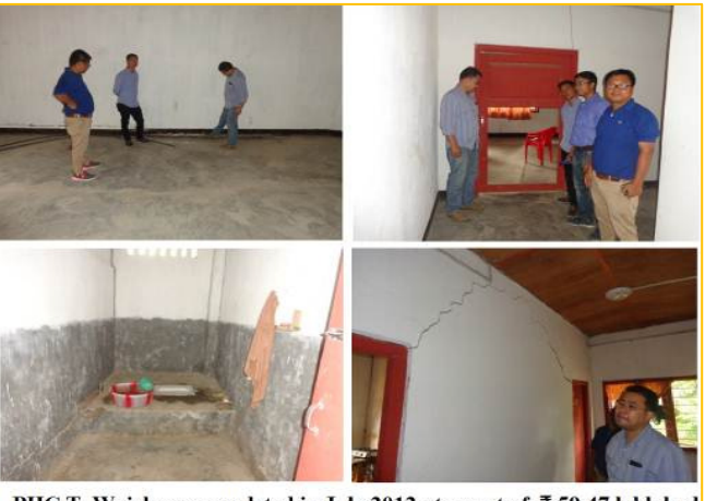
PHC T. Waichong completed in July 2012 at a cost of ₹ 59.47 lakh had developed cracks at the joining of wall and floor, crack in the ward rendering it unusable, toilet without water connection and crack on the wall

a) Primary Health Sub-Centre (PHSC): Out of the 18 test checked PHSCs, poor quality plaster on walls, poor condition of floor/no pucca flooring, open waste disposal