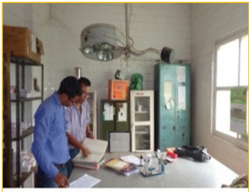
OT room of CHC Kangpokpi used as store room (only ₹ 7.03 lakh out of approved amount of ₹ 14.06 lakh was released)