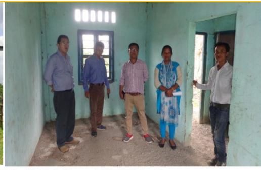
Abandoned Institutional building and dilapidated floor at PHSC Sadim

Thus, non-utilization of the designated health infrastructures resulted in not only unfruitful expenditure but also deprivation of the facility to the public/officials.