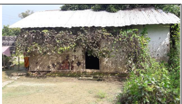
Dilapidated condition of Khongjom Mamang AWC of Thoubal Project in Thoubal district.

Even after four decades (since 1975) of implementation of this flagship scheme, the State failed to provide good infrastructural support to the AWCs thereby adversely affecting the quality of services rendered. An AWC with good infrastructure and requisite facilities can serve as the primary attraction for parents, encouraging them to send children for feeding and pre-school education. The existing infrastructure of AWCs is not likely to attract intended beneficiaries to the centres.