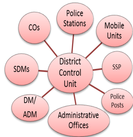
Intra district communication system