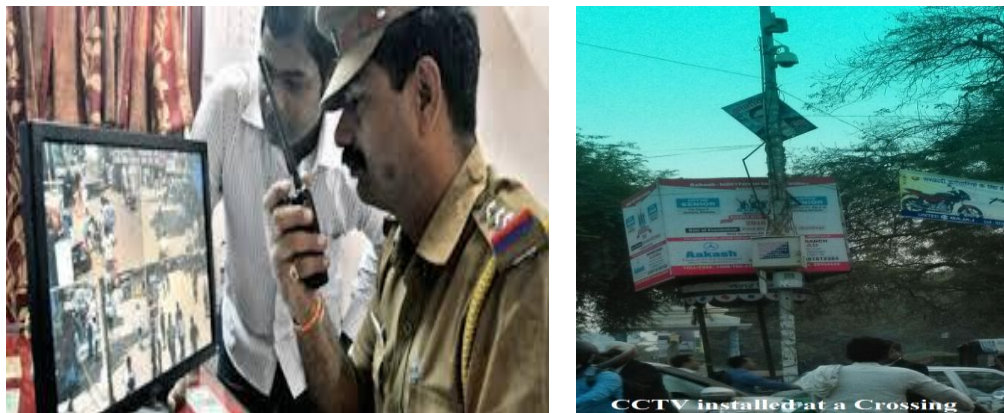
City Surveillance by CCTV

and maintenance of law and order. The CCTV cameras are also being used in important cities under city surveillance system. CCTV cameras are connected with the Control Rooms to monitor the activities happening at the spot where these are installed.