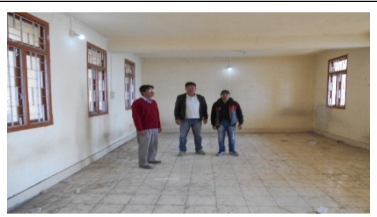
Empty hostel rooms at GHSS Lumla

In reply, the State Government stated (December 2017) that there are no such Higher Secondary Schools as Numada and Boulda in Tawang District. Considering that the Numada and Boulda to mean Lumla and Bomba respectively, the project were started in right earnest and District Level Committee, Tawang approved proposal for Hostel Buildings at Lumla and Bomba in May 2010.