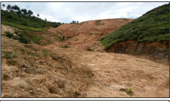
The site where the KGBV building was stated to have been constructed.

• 'One-Unit Type-I Quarters at KGBV School, Mechuka' (₹ 7.00 lakh) executed by BDO, Mechuka, West Siang district in March 2015 was not found at site. The site-Engineer stated that the building had been washed away due to heavy rain.