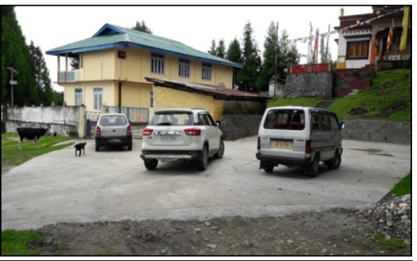
CC platform constructed instead of playground in the middle of an approach road to a private residence.

'Playground at Changprong' (₹ 9.00 lakh) executed by BDO, Tawang Block during 2016-17 was found to be a concrete platform on approach road to a private residence which was being used as parking space. The site-Engineer stated that due to non-availability of suitable land, the playground was constructed at the present site.