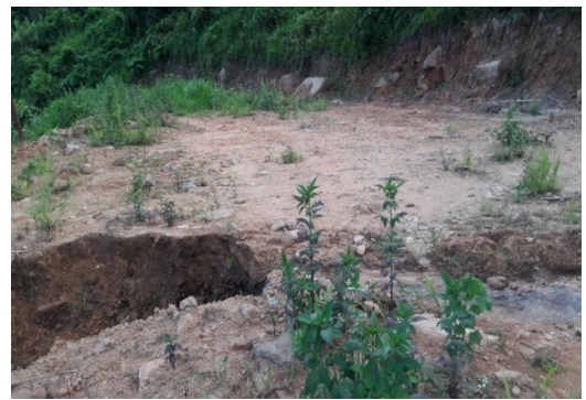
The deplorable condition of 'Playfield at Kodokha (Takiomporing)'.

playground due to non-levelling of ground and non-construction of approach road to the site.