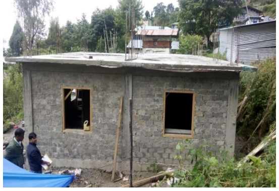
Physical progress of 'Staff quarters at PHC, Seru' found during joint inspection.