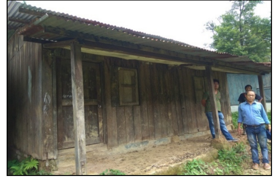
The dilapidated condition of 'Teachers Quarter at Ragmi Primary School' constructed at the cost of ₹ 15.00 lakh.

wooden walls by the BDO, Nacho Block, Upper Subansiri district in 2012-13. The building was found (August 2017) lying idle in dilapidated condition.