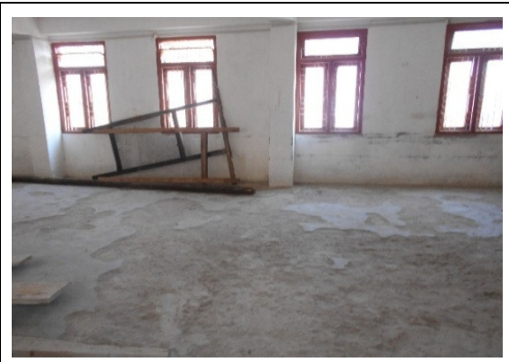
Deteriorating floor and empty hostel rooms at GSS Bomba