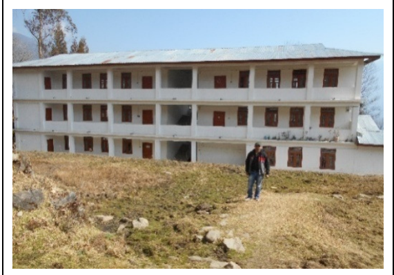
Empty and unoccupied girls hostel at GSS Bomba