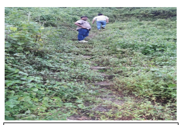
CC Steps at \overline{\bullet} 9.00 lakh was constructed for village where there was no habitation.

(i) 'Porter track from BRTF Road to Karam Village' (₹ 3.00 lakh) and (ii) 'CC Steps from BRTF Road to Government Primary School Karam' (₹ 9.00 lakh) executed by Siyum BDO, Block, Upper Subansiri district in 2013-14 and 2015-16 were found executed at a location where there was no human habitation. The site-Engineer stated that the inhabitants had shifted to another village.