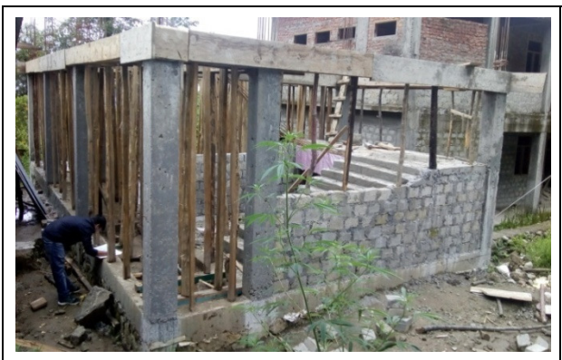
The status of the work 'Rostrum at Seru Secondary School' shown to have been completed in March 2017.