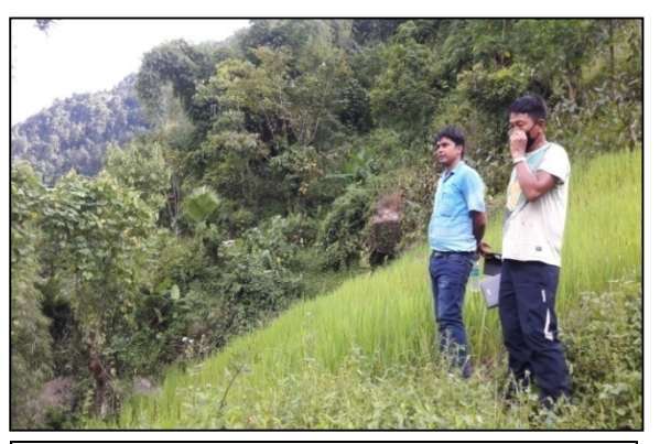
No cardamom plant was visible at site where cardamom garden was stated to have been established.

2017), the departmental representative (Horticulture Development Officer) could not locate even a single cardamom plant at site in Pakring village.