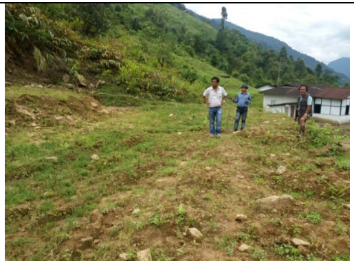
'Playground at Karam Primary School' and 'Playground at Doginalo Primary School' were not in playable condition.

• As per records, BDO, Siyum block, upper Subansiri district constructed (2015-16) a boundary fencing around PHC at Pagenalo' (₹ 7.00 lakh) with iron angle post and chain link fencing (sausage wire) under BADP. Joint inspection revealed that the fencing was constructed around an abandoned building and the entire area was used for cultivation of paddy.