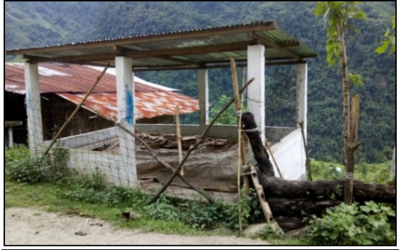
Bus Waiting Shed at Row Village enclosed with sausage wire being used as store room.

Housing, Jairampur Division, Changlang district during 2013-15 were found being used as labour sheds during joint inspection.